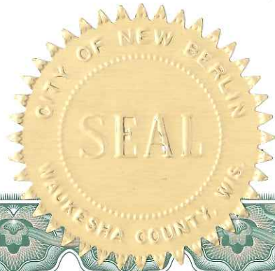
The Honorable Mayor David A. Ament City of New Berlin

IN WITNESS WHEREOF, I do hereby set my hand and cause the Corporate Seal of the City to be affixed this 18 th day of April, 2017.